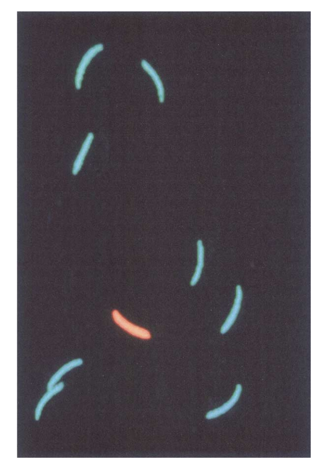
Fig. 1. Live sperm stain green (485/10, BP 540/20), dead sperm red (557.5/27.5; live/dead<sup>TM</sup> Sperm Viability Kit L-7011, Molecular Probes).

nm). Both solutions stain sperm heads only (Fig. 1). We used Schneider's Medium (GIBCO BRL 21 720-024) with heat-inactivated (30 min/56 °C) 10% fetal calf serum (EUROBIO 01 0056) as buffer. This protocol is an optimization of the protocol of Molecular Probes for our study organism. Samples were analyzed for epifluorescence (Reichert-Jung Polyvar microscope, Hamamatsu C5405, Argus-20). To ensure accuracy, we examined 46 images and recorded them under both light and fluorescence microscopy. Ninety-six percent of the cells seen in light microscopy could be found in the fluorescence image. Overall, 5% (678 out of 13 654 sperm cells) of the cells were doubly-stained (green in centre, red at ends), and were included as dead cells. In a preliminary experiment, we ensured that no dead sperm stain green by heating the testes (10 min/60 °C), which resulted in all cells staining red. We counted live sperm (green, 485/10, BP 540/20) automatically (NIH Image), after calibration to sperm head size in a preliminary experiment (320 images, 4 males). Dead sperm (red, 557.5/27.5) were counted manually, to avoid counting dead tissue of a size similar to sperm heads.